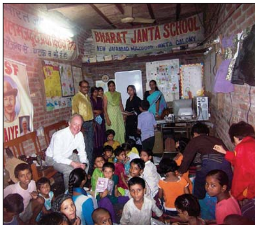
DELHI SCHOOL VISIT | Peter Lilley visited a slum school in Delhi as part of his work as Chairman of the Global Poverty Commission.

After Chairing the Global Poverty Commission last year, Peter Lilley is taking a leading role in planning a new campaign to give all low income countries real opportunities to trade out of poverty.