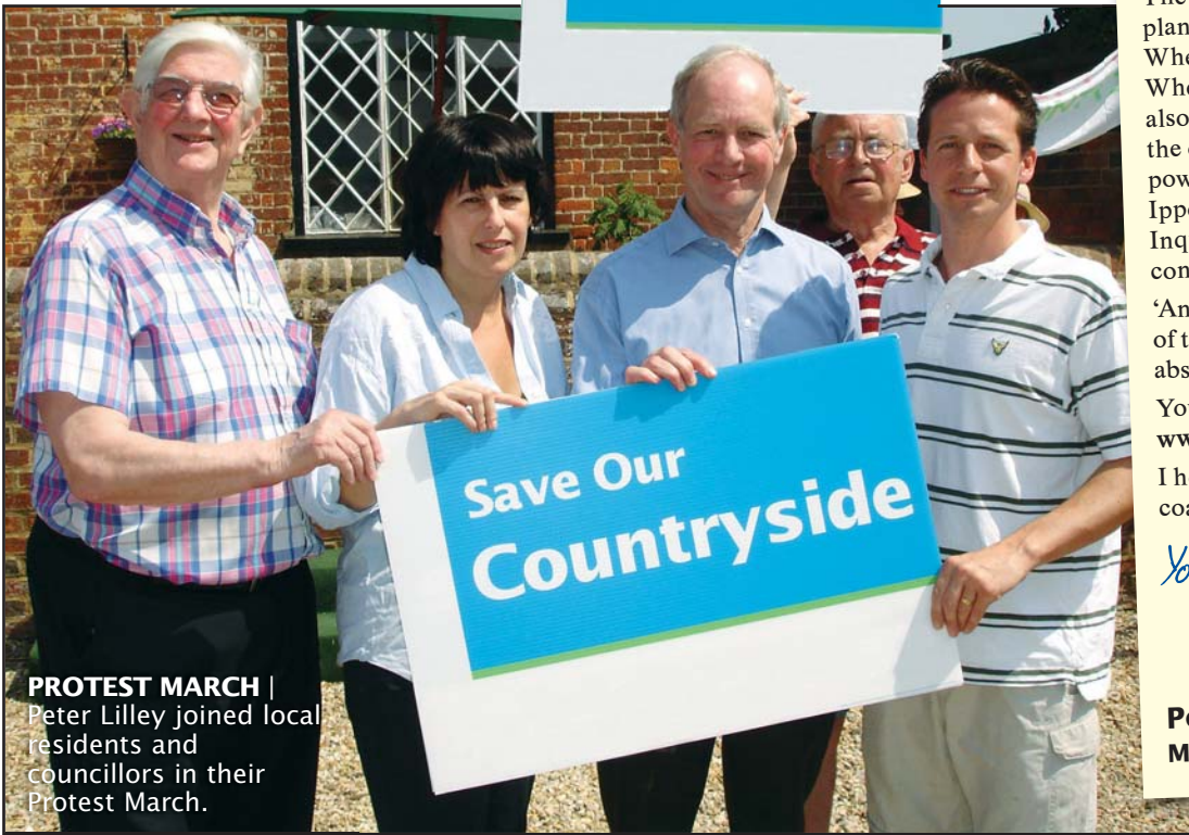
PROTEST MARCH | Peter Lilley joined local residents and councillors in their Protest March.

Plans by Luton and Bedfordshire Councils to meet their housing targets by building thousands of houses over the Hertfordshire Green Belt have been withdrawn by developers, Bloor Homes.